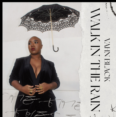
WALK IN THE RAIN 2025