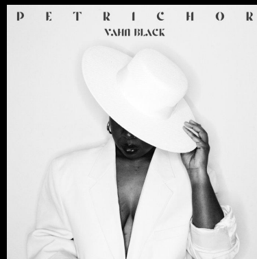
PETRICHOR: THE JOY OF GLADYS BENTLEY 2023