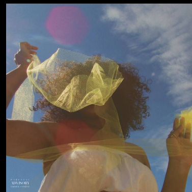
TEMPORARY COLORS 2020