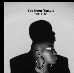
I'VE BEEN 'BUKED 2024