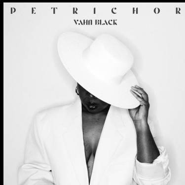
PETRICHOR: THE JOY OF GLADYS BENTLEY 2023